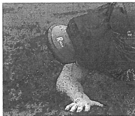
Crumb rubber infill pellets on playing field at Centerville High School, Centerville, OH.

Installing synthetic or artificial turf (AT) used to refer to replacing grass with what was essentially a green-painted, rough plastic carpet with “blades” designed to look like real blades of grass. AT now contains “ infill ” material between the blades to soften the surface of the turf and to provide cushioning. These infills may be composed of organic products (see below) or crumb rubber. Crumb rubber is widely used in the synthetic sports field and landscape market. The most popular type of AT infilled with crumb rubber — Fieldturf® — is used extensively in athletic fields and stadiums and generally lasts for eight to ten years. 4